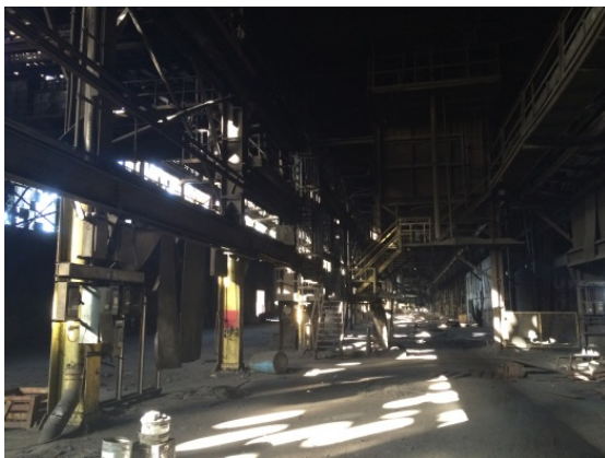
Bursts of sun-light brighten up empty plant.

Buckeye, since the late 1800's, made castings for the railroad industry. Including freight car systems, components and 4-wheel trucks. AAR Type Knuckles, couplers (rotating & locomotive), side frames, bolsters, 6-wheel trucks, mass transit undercarriage systems in addition to their "The Z Knuckle". Buckeye could handle Industrial Castings from 100 to 100,000 lbs.