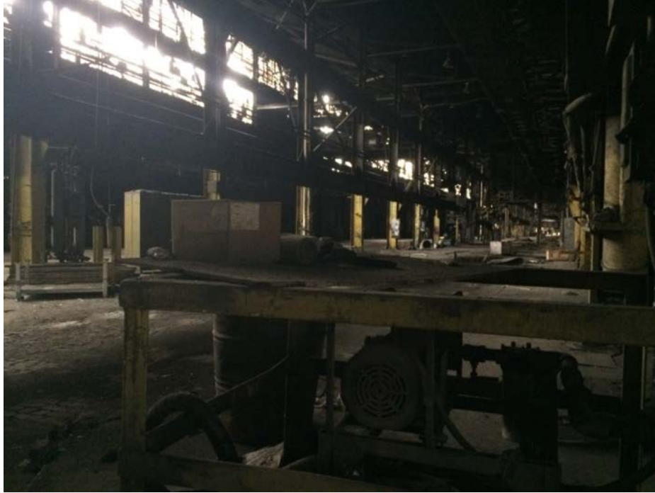
The now cavernous buildings could tell much history.