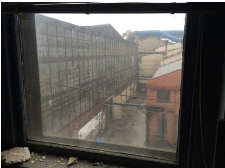
The original North building is solid plate glass.

Ron Widman will have some Buckeye Steel Castings sales brochures to hand out at the November meeting.